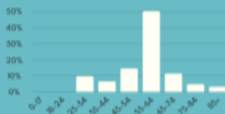
Age Distribution of KITHS Clients

Since KITHS opened its doors on May 1, 2017, there have been 97 unique clients served through 203 service visits.